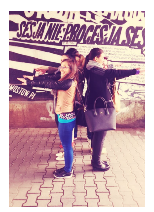
Fig. 5 A group of students presenting the letter "T" from the game crosswords. Location VII.