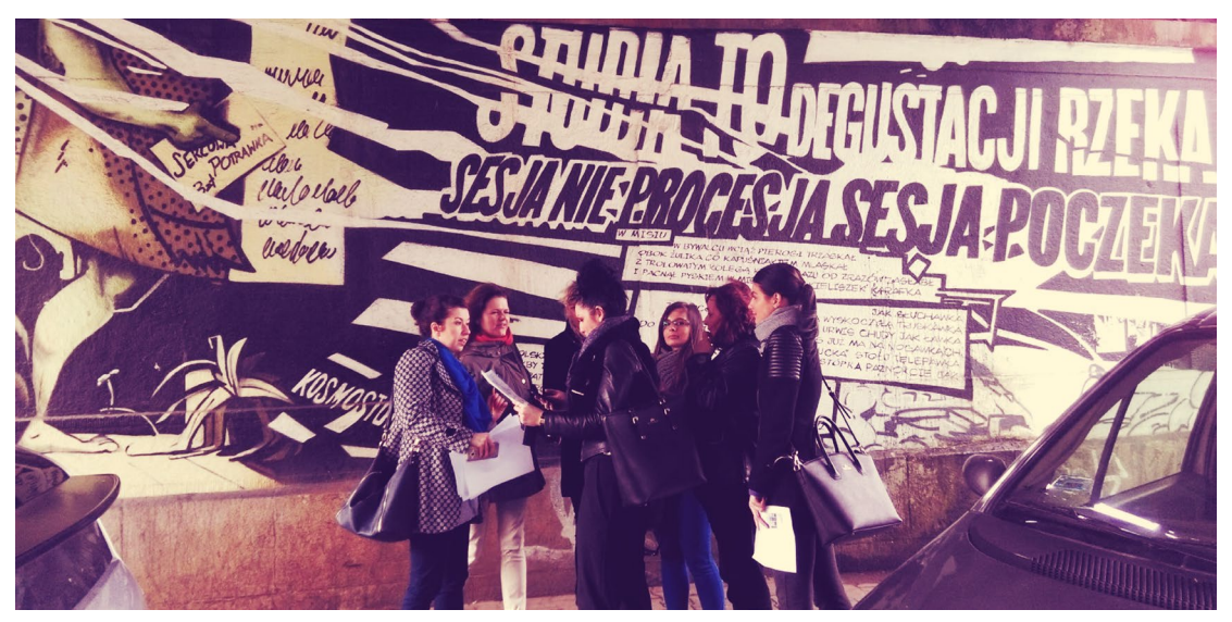
Fig. 3 A group of students after finding Location VII.