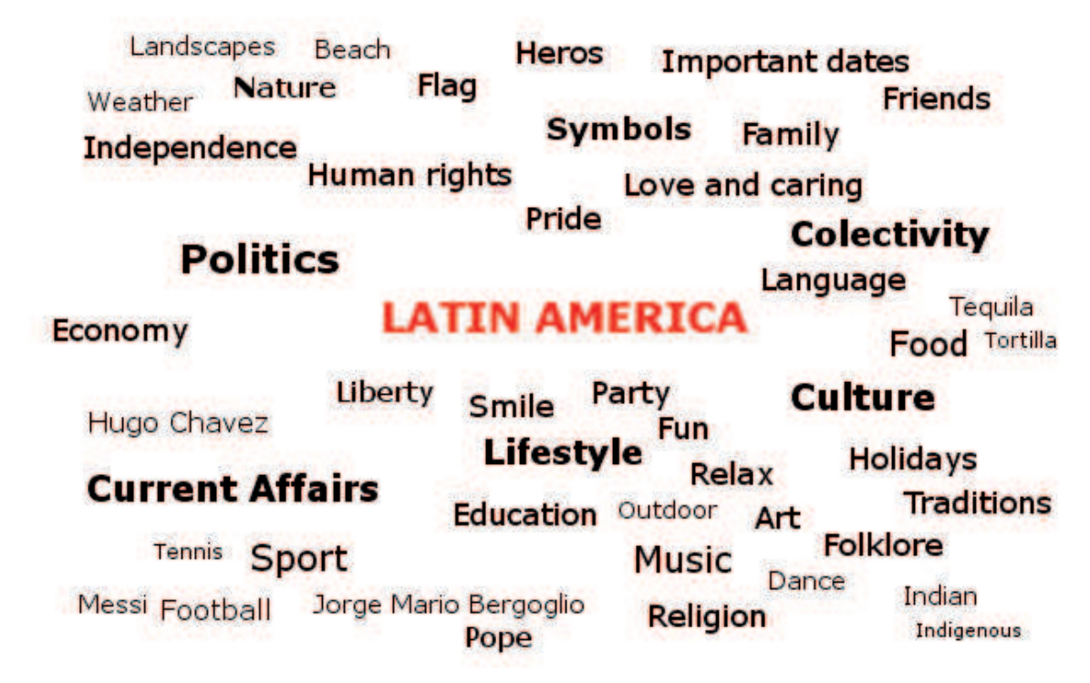
Picture 2. Semantic field related to the Latin American culture

Moreover, one of the most significant characteristics of the presented data is the fact that the above elements communicated on Facebook correspond to all the three levels pointed out by Windley (2005).<sup>6</sup> Latin Americans eagerly communicate their places of origin through attributes (e.g. music they listen to or pictures they publish), preferences (e.g. joining political fan pages or liking posts and links of others) as well as traits (personal data, personal photos). What does it possibly mean for the research findings? National culture is present in many aspects of online communication. Interestingly, it is relevant due to the fact that in the case of the scrutinized research sample, observed attributes, which from their nature tend to be changeable and traits, which change slowly, if at all, seem to be in a close relation to each other. It is because all the small unstable activities represented by attributes represent a genuine involvement. A good example to this could be supporting and linking articles related to sport (e.g. Messi, FC Barcelona football player with Argentinean origin) or flag exposition on national holidays, what represents national pride in both indirect and direct ways.