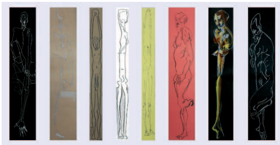
Figure 3. Student Works, Nurbiye Uz Photo Archive, 2018

Then, they were asked to fit the model on to the given paper leaving at most half a centimeter from all edges. Drawing a fully fitted human form on a 5x50 paper brought deformation alongside. Evaluation done after the class, which is conducted with constant motion, and changing the duration and the paper size, revealed that students came up with very different solutions. Therefore, individual interpretation and creative thinking was improved (Figure 3-4).